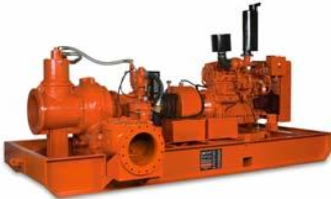
Godwin Pumps - CD400M Dri-Prime Pump