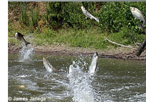
Brainerd Regional DNR Office

Wednesday, February 15, 2012 Holiday Inn, St. Cloud, MN